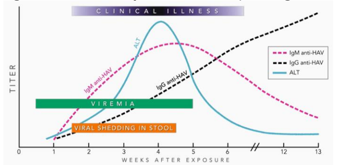
Figure 3: Events in Hepatitis A Infection, Serologic Course